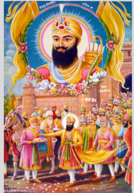
Guru Hargobind Sahib Ji Sixth Guru in the Sikh Faith